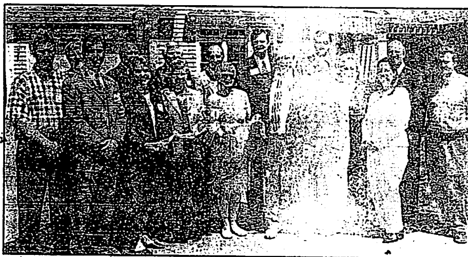
Surrounded by the team that made The Garden Homes a reality, the first residents and public officials cut the ribbon that opened the model.